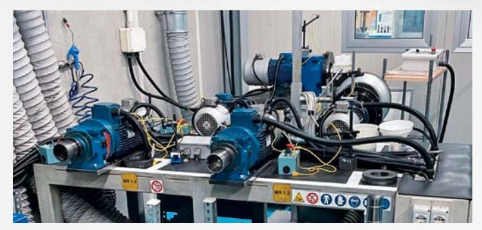
Specialized dynamic rotary testing equipment qualifies products and proves their performance.

After 1,000 hours continuous rotation at 1 m/sec in water and sand, Trelleborg materials showed no leakage, demonstrating their long-life performance.