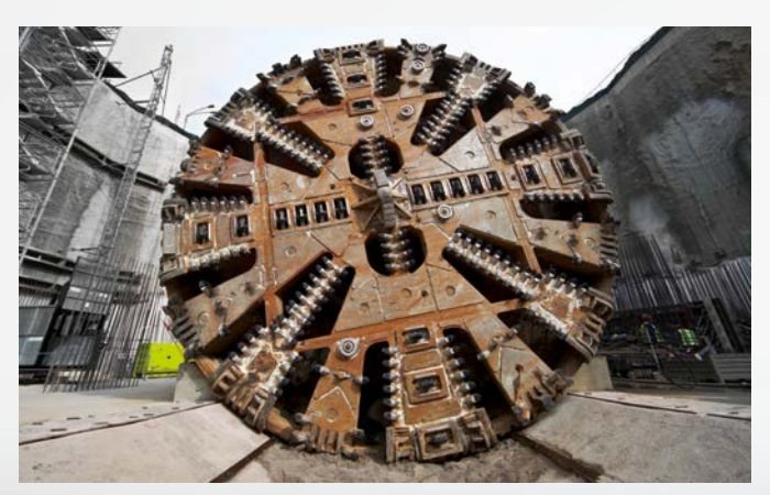
Nexus Face Seal is proven to withstand the extreme environments of construction and mining operations.