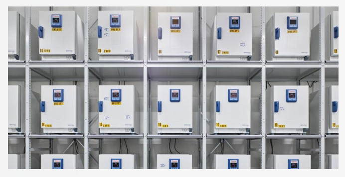
Ovens in the Trelleborg Sealing Solutions Material Laboratory are used to test materials for compatibility with CIP media.

FoodPro<sup>®</sup> EPDM materials demonstrate long life in polar media and excellent compatibility with alkaline cleaning agents, retaining hardness and tensile strength, while exhibiting little volume change.