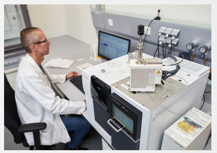
Gas chromatography-mass spectrometry equipment in the Trelleborg Sealing Solutions Materials Laboratory identifies different migrating substances in samples.

To test materials for specific substances, a targeted analysis uses advanced analytical techniques. Depending on the migrants under examination, liquid chromatography, gas chromatography and mass spectrometry devices are used in different combinations.